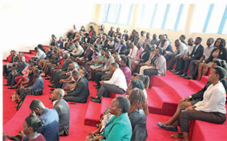
► Staff attending the public lecture