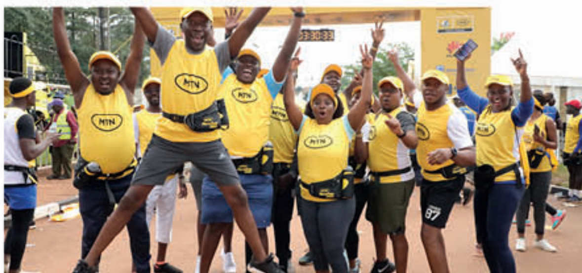
► URSB Staff pose at the finish line after participating in the 2022 MTN Marathon