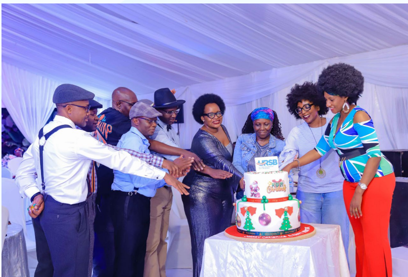
Top management join board members and the Registrar General to cut cake

an opportunity for team members to unwind, interact across directorates, and recognise the collective efforts that have driven URSB's success throughout the year.