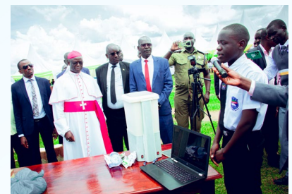
Student demonstrates hands-free dust bin that alerts users once it's full

During the launch, students showcased their inventions developed through their Robotics Club, which was started two years ago to enhance innovation by the science students.