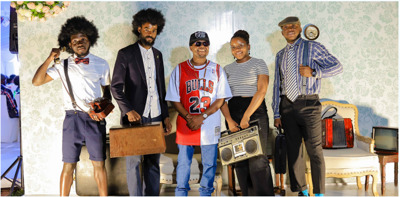
The PR Unit grooves through time with a blast from the past

shared success. The event, held in a lively and nostalgic atmosphere at the picturesque Nican Resort in Lweza, served as a moment of appreciation, reflection, and bonding among colleagues.