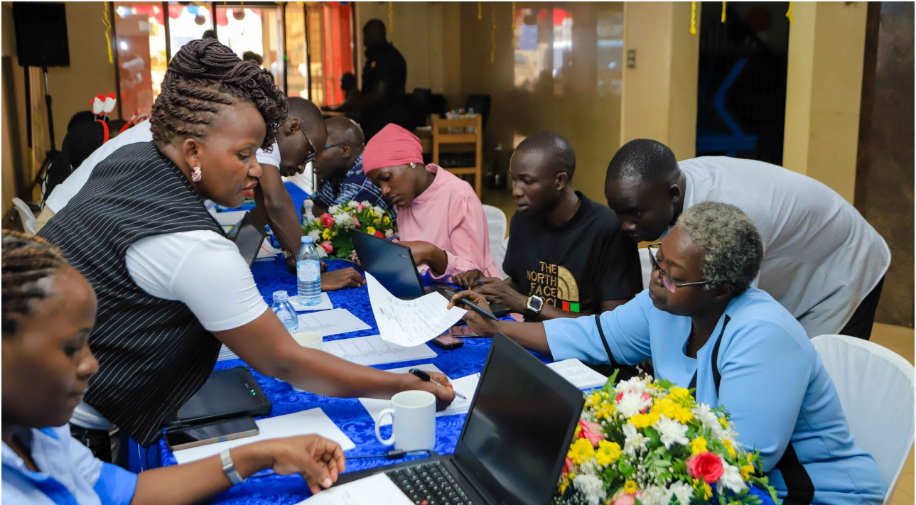
URSB staff help customers to access online registration services at the Georgian House office in Kampala

the bureau's digital changes. It took place in all URSB offices and six regional locations, where clients learned more about the organisation's digital services.