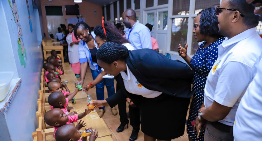
URSB staff interact with the children as they enjoy some refreshments

The Uganda Registration Services Bureau (URSB) has once again demonstrated its commitment to community welfare by donating food supplies, medicines, and child-care items to Menggo Babies' Home. This generous gesture forms part of URSB's ongoing Corporate Social Responsibility (CSR) programme aimed at improving the lives of vulnerable groups across the country.