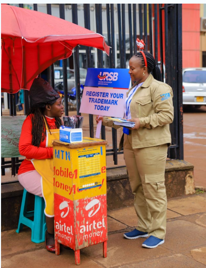
URSB staff educated business owners about the benefits of registering their businesses

feedback collected was valuable. It showed how users felt and pointed out areas that could be better.