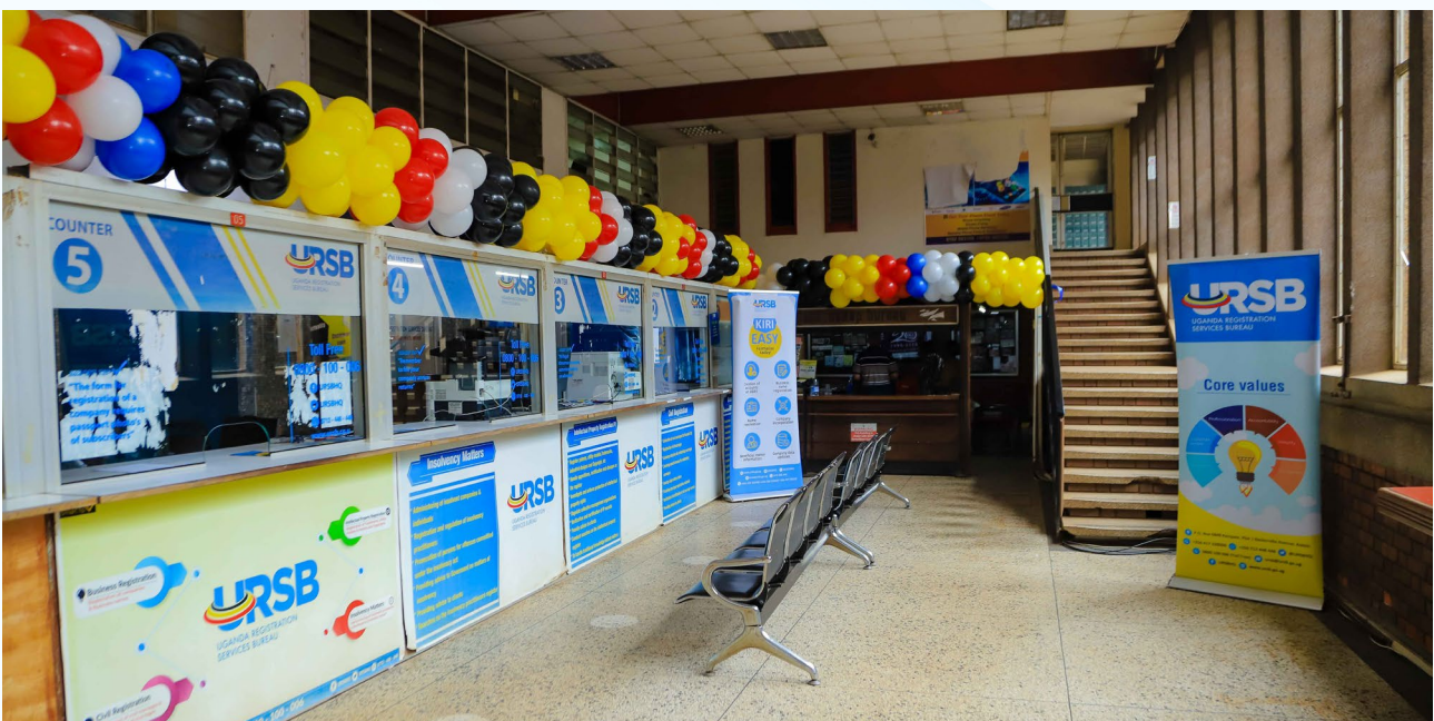
The registration hall where customers were received and their concerns addressed

included collecting feedback through surveys, campaigning on the streets, and showing how URSB’s digital services work.