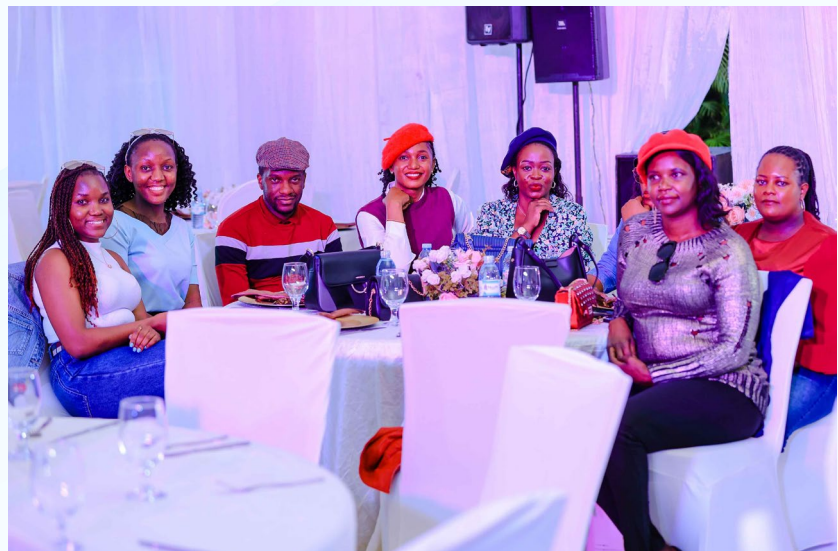
URSB staff enjoying the party

As the event drew to a close, there was a strong sense of optimism for the year ahead. With renewed energy and a strengthened team spirit, URSB looks forward to building on its achievements and furthering its mission in the coming year.