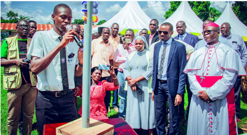
A student demonstrates a solar-powered prototype system developed as traffic lights to ease congestion on major roads

The Uganda Registration Services Bureau (URSB) has proudly launched the first-ever Secondary School Technology and Innovation Support Centres (TISCs) at Comboni College and Dr. Obote College in Lira District.