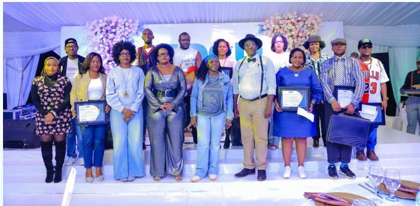
Staff were presented with certificates for excellent performance

“We have worked tirelessly to improve our services, simplify registration processes, and extend our reach to more Ugandans. Tonight, we celebrate these wins, but more importantly, we celebrate you—the team behind URSB’s success,” She said.