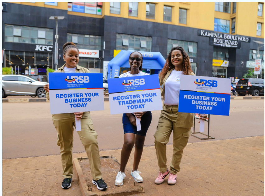
Customer Engagement Week is about building better relations with clients

The event had some problems because of network connectivity issues at Georgian House. This made it hard for people to access online services. To solve this, the URSB plans to improve its technical setups for future events. They also want to reach out to more places across Uganda.