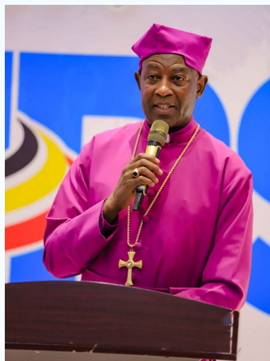
Archbishop Kaziimba Mugalu was the celebrant of the day

“We must appreciate God for what he has done in our lives,” Archbishop Kaziimba said, adding, “Thanksgiving is an opportunity for us to make this known. Let us create a culture of forgiveness, unity, and empathy, values that God wishes for humanity.”