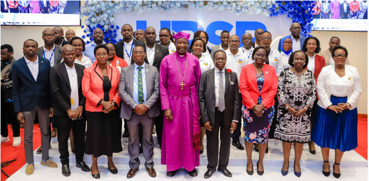
Archbishop Kaziimba with URSB Board Members and top and senior management at the URSB Headquarters in Kololo

board members, and stakeholders to reflect on the year's blessings and renew their commitment to excellence in service.