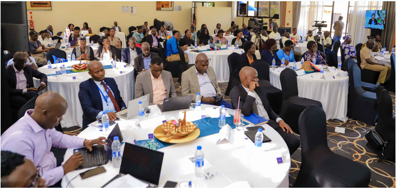
Guests at the Geographic Indications Conference at Protea Hotel

W IPO is the United Nations Agency providing services that enable creators, innovators, and entrepreneurs to protect and promote their intellectual property (IP) across borders.