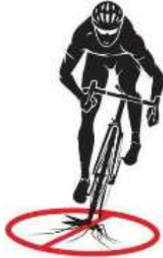
RIDE AGAINST MALARIA